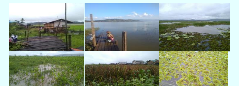
-Direct latrine, detergents, blue green algae, plant nutrients, fertilizers and mining wastes can cause the adverse effect on the water quality and lead to the sedimentation and eutrophication of the lake.