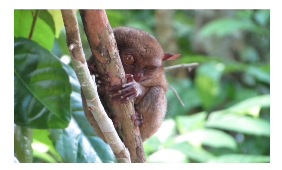
Tarsier Sanctuary Corella, Bohol

This fascinating platform conform a traditional hut and floated by twin boat-hulls that serves as a restaurant. Eating with local delicacies while enjoying the green landscape along the Loboc river is a lush experience. Onboard local band entertainers and local dance group on half way of the cruise are alluring entertainment.