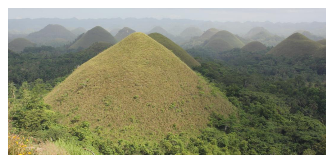
Chocolate Hills Carmen, Bohol

The Chocolate Hills is a geological formation of at least 1,260 hills spread over an area of more than 50 square kilometers (20 sq mi). Hills are covered in green grass that turns brown like chocolate during the dry season, hence the name.