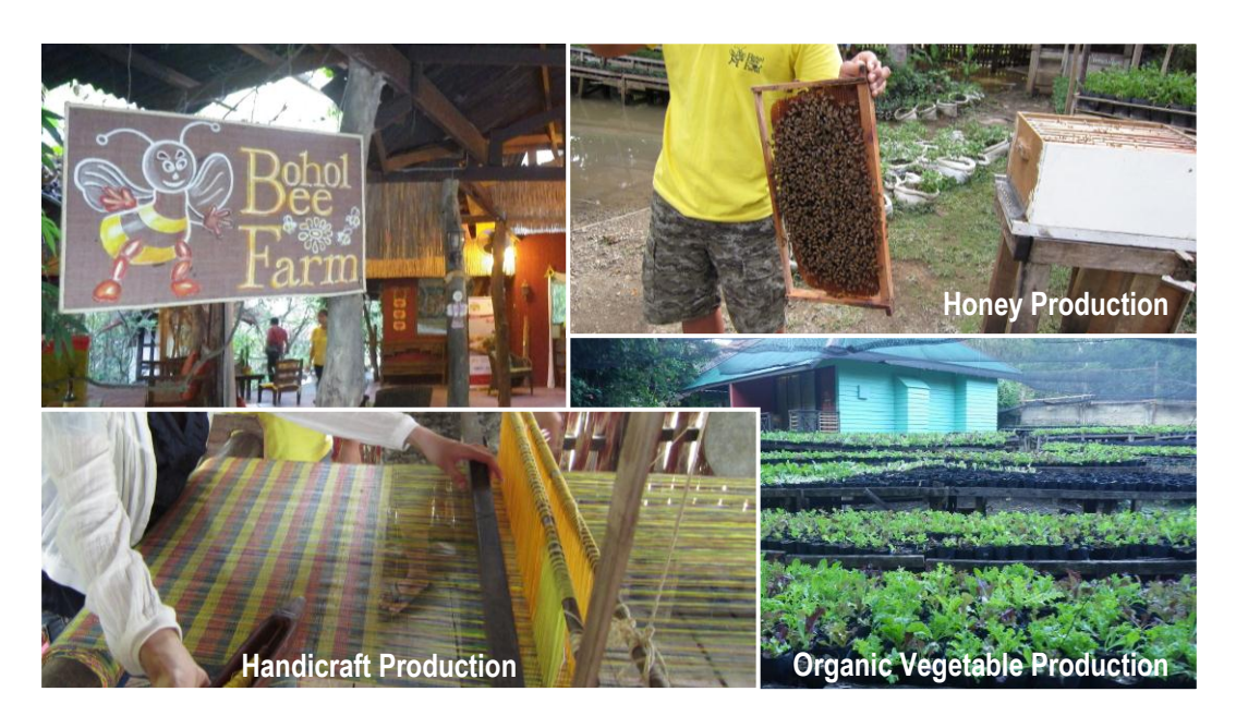
Bohol Bee Farm Dauis, Bohol

The Bohol Bee Farm support an agricultural development that leads to healthier soils and diverse agricultural ecosystems, conditions that help promote a better environment.