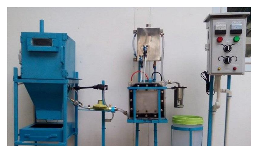
Fig. 3 The hydrogen gas incinerator plant with 3 sections