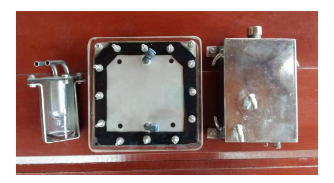
Fig. 1 Hydrogen gas production equipment

Part I: Water Separation Systems, the general process of water electrolysis, hydrogen ions move toward the cathode, whereas hydroxide ions move toward the anode. A secondary electrochemical cell using aluminum plates as electrode which is drilled for water flowing between each layer. The insulator is made of rubber cutting edge in every sheet preventing water out of the box. Aluminum sheets and rubber sheets are arranged alternately as you can see in Fig. 1. It is pressed tightly with screws and nuts enclosed with acrylic plate to prevent water leakage. The tube is used to connect between the reserved water box and electrolysis box. Hydrogen gas from splitting water by electrolysis procedure then it flows into the reserved water box and flows to the air filtration set. The water inside the box is full at all the time. Because this design does not have a gas separating type. The gas in electrolysis procedure is a mixture of hydrogen and oxygen which is used as a fuel. It will pass through a one-way pipe towards the following combustion systems.