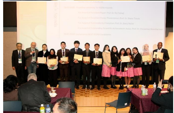
Scenes taken from the 16th ICERD from 13rd to 16th March 2025