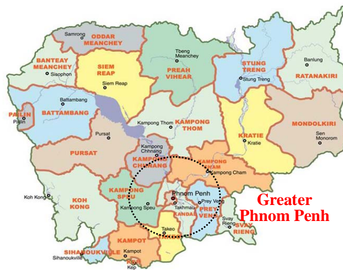
Fig. 1 Location of Phnom Penh and Greater Phnom Penh

As shown in Fig. 1, Greater Phnom Penh covers not only Phnom Penh but also surrounding provinces, such as Kampong Cham, Kampong Chhnang, Kampong Speu, Kandal, Prey Veng and Tako. The area and population of each province are summarized in Table 1. These provinces being close to Phnom Penh have a strong relation in food demand-supply and economical aspect. Total area and population of Greater Phnom Penh is 34,641 square km and 7,250,881, respectively. Also as shown in Table 2, more than 90% of population is in rural area in surrounding provinces, although 93% of population in Phnom Penh is in urban area.