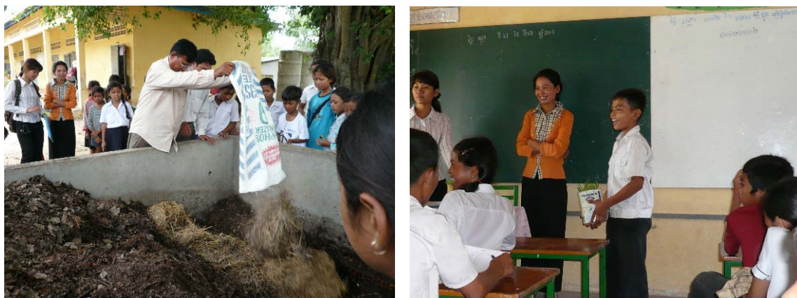
Fig. 4 Food, agriculture and environment education through composting and students' activity report at elementary schools

RCE Greater Phnom Penh comprises member organizations from various fields with a wide range of expertise which are engaged in ESD and its related activities. The stakeholder organizations include Royal University of Agriculture (RUA) and Institute of Environment Conservation and Rehabilitation, Cambodia Branch (CaM-ERECON), which work as coordinators of RCE Greater Phnom Penh in the Secretariat Committee, Ministry of Agriculture, Forestry and Fisheries, Ministry of Rural Development, Ministry of Education, Youth and Sports, several elementary schools in Phnom Penh and Kampong Cham and so on.