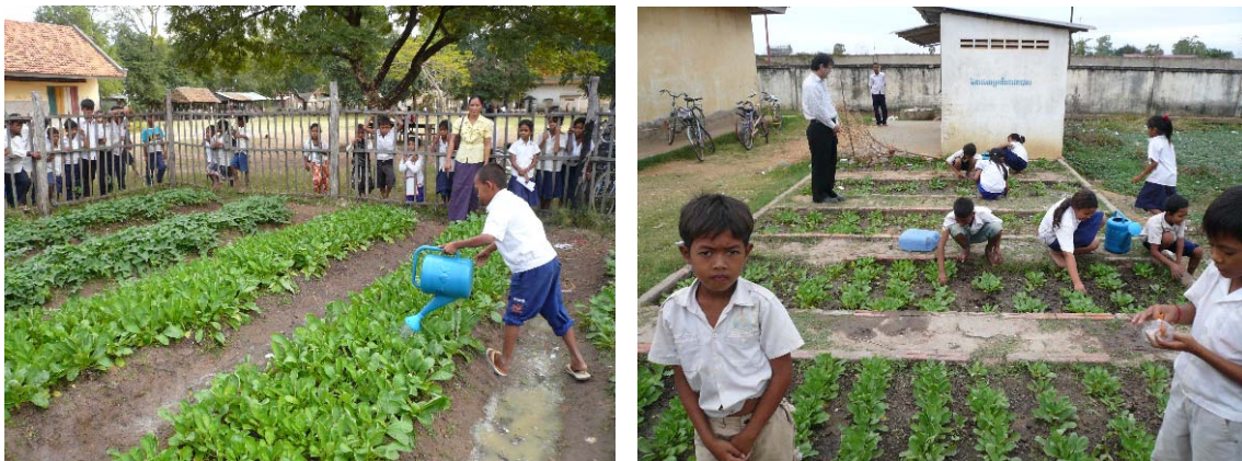
Fig. 3 Food, agriculture and environment education through cultivating vegetables at school organic gardens in Phnom Penh and Kampong Cham

Accordingly, as regional challenges in the education for sustainable development (ESD), an attention has been paid to sustainable processes for rural development. Although there are some factors constituting sustainable rural development as economic growth, social development and environmental conservation, the food, agriculture and environment education was focused as a first step for approaching sustainable rural development in the area of Greater Phnom Penh as shown in Fig. 2. Especially, the students in the elementary schools were prioritized, as they will become farmers in the future. So, one of current challenges in RCE Greater Phnom Penh is enhancing the food, agriculture and environment education for elementary schools through the organic farming activities at elementary schools and the facilitator training of elementary school teachers under the collaboration among government, university, local NGO and local community.