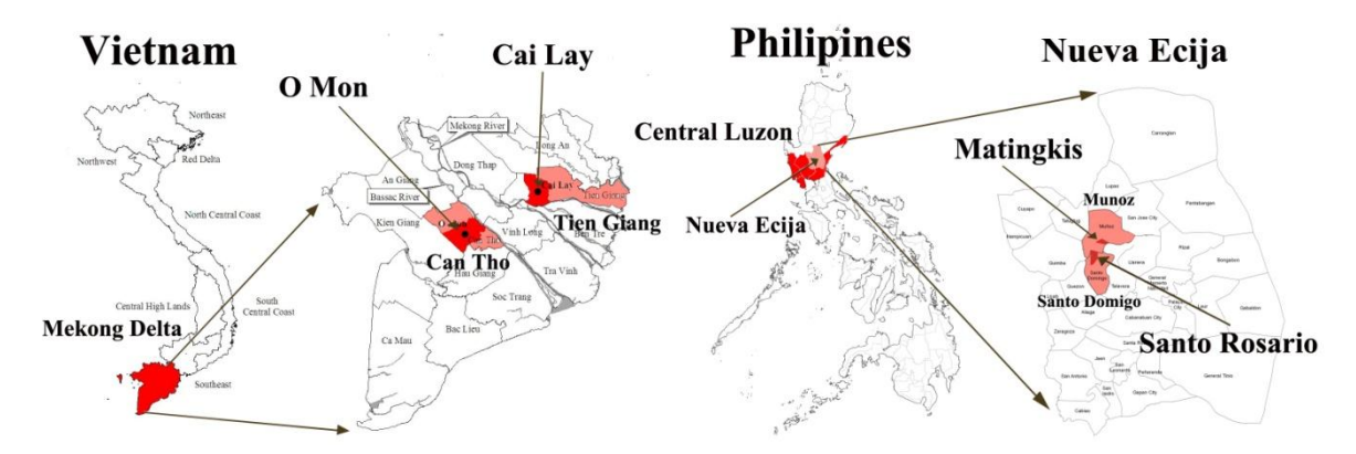
Fig. 1 Map of study sites in Mekong Delta, Vietnam and Central Luzon, Philippines

The focus group discussions (FGDs) were also conducted in each site after completing the survey and key informant interviews for adopters to provide and share information on straw mushroom production as well as their advantages and disadvantages, to assess the possibility of introducing straw mushroom production and to identify the mechanisms of growing the crop at the studies sites.