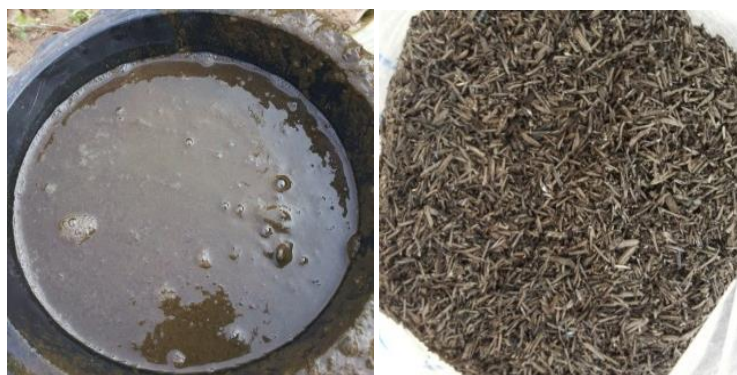
Fig. 1 Liquid bio-slurry (left) and rice husk biochar (right)

Note: RHB=Rice Husk Biochar, LBS=Liquid Bio-slurry.