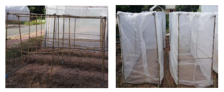
Fig. 2 Covered-bed net

After 12 days of germination stage, Chinese mustard plants were transplanted with a distance of 0.01 \text{ m} \times 0.01 \text{ m} between rows and plants, respectively.